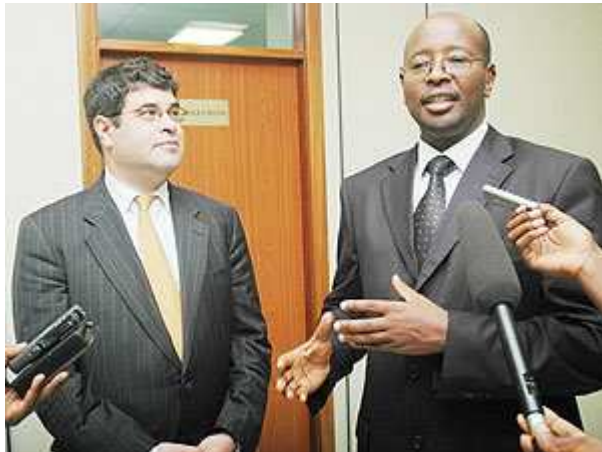
US Deputy Secretary of the Treasury Neal Wolin (L) and Finance Minister, James Musoni talking to the Press.